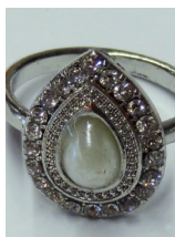
Cleaning of dirt arising from wearing