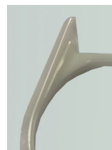
Cleaning of polishing pastes