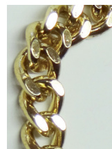
Cleaning of polishing pastes